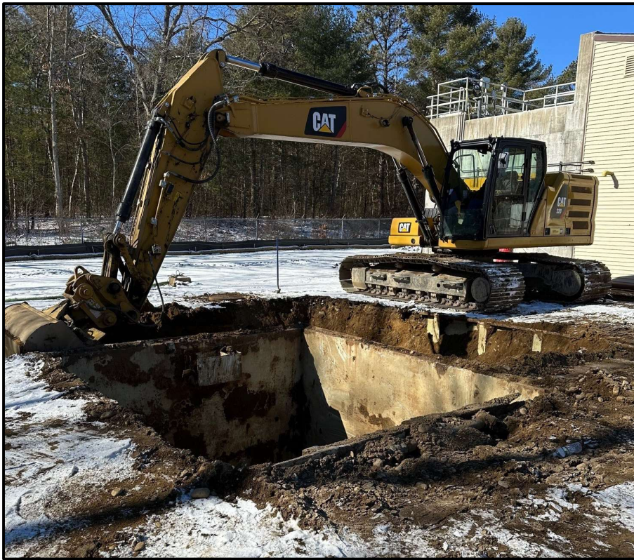
Excavation and Demolition of Existing/Abandoned Clarifier Tanks