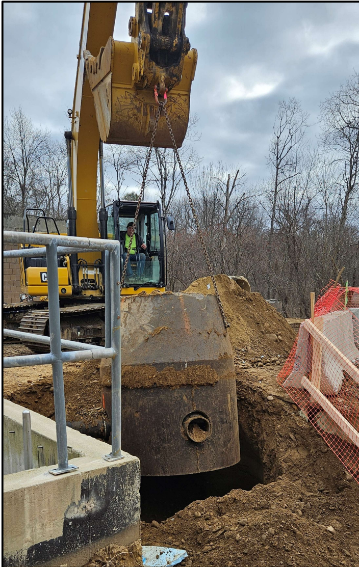
Demolition of Existing Effluent Manhole